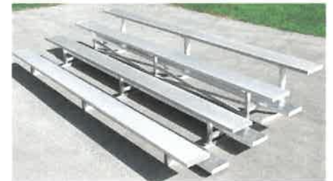
Notional seat concepts.