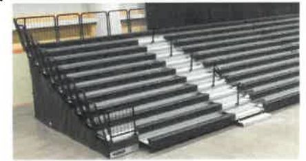
Notional seat concept.